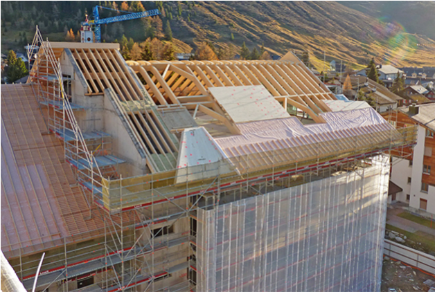
Assembly of trusses and roof elements building H3