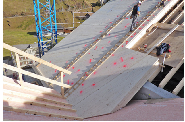
Assembly of roof elements on the primary structure