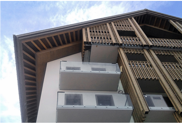
Detail view canopy corner