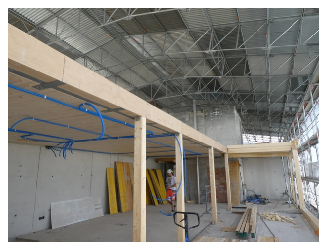
Addition under the emergency roof