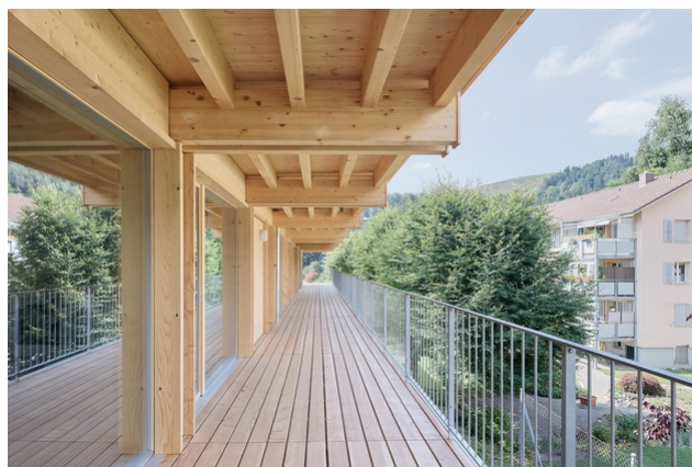
On the pergolas serve to protect the wood and are outdoor space at the same time.