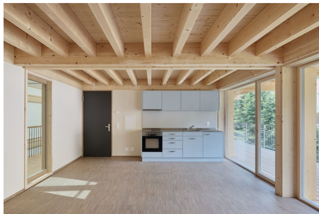
In the apartments remains visible a lot of wood.