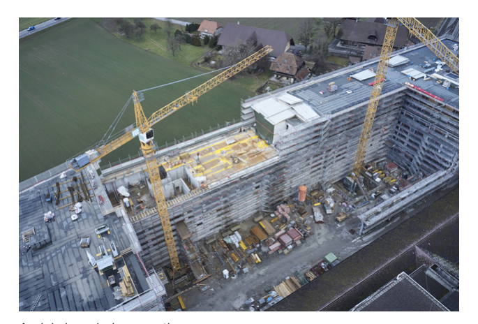
Aerial view during erection