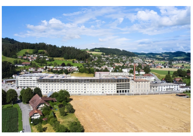
Aerial view of the finished building