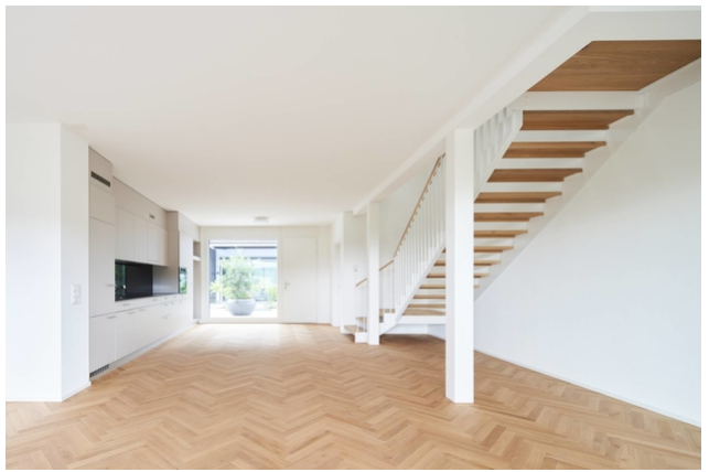
Interior view of the finished apartment