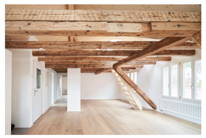
Room (with ascent)