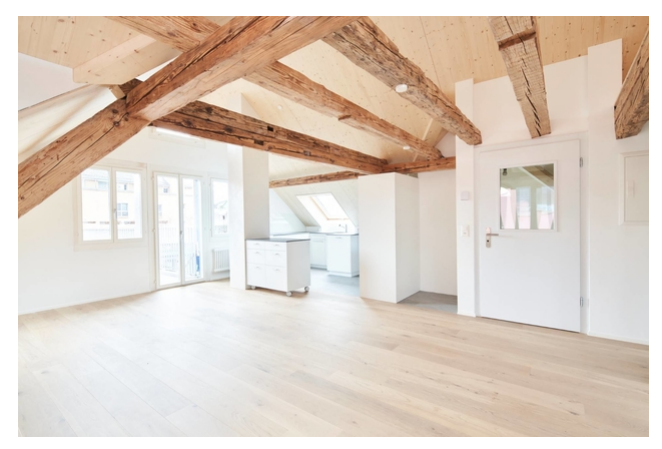
Room with kitchen