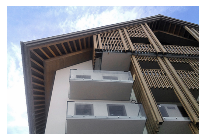
Detail view canopy corner