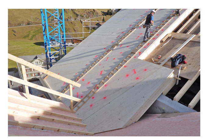
Assembly of roof elements on the primary structure

project - cost estimate - construction project - fire protection - statics / construction - tendering - implementation project site supervision - site inspections