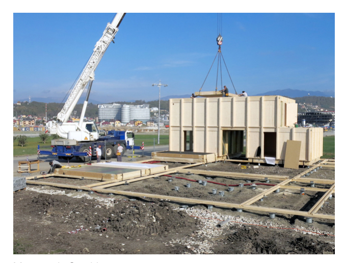
Montage in Sotchi