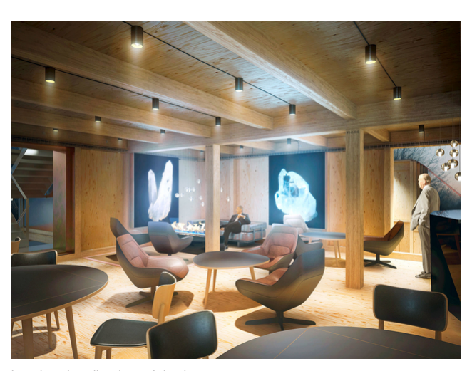
Interior visualization of the lounge