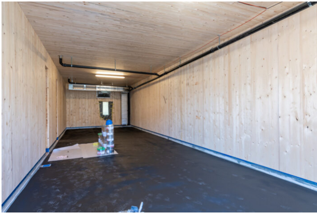
2nd floor