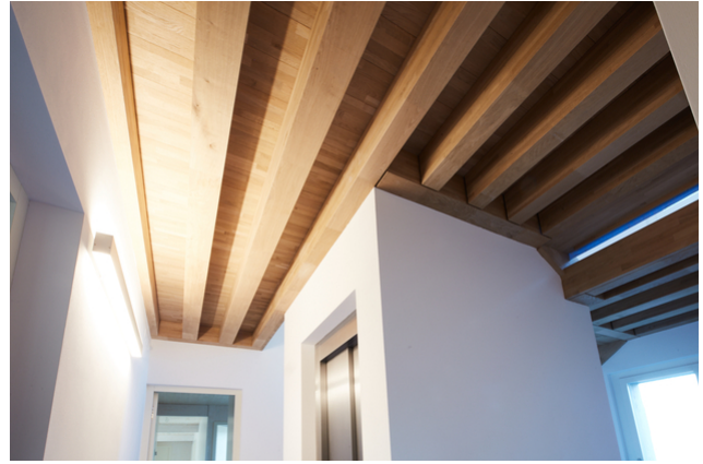
Staircase and elevator shaft in wooden construction