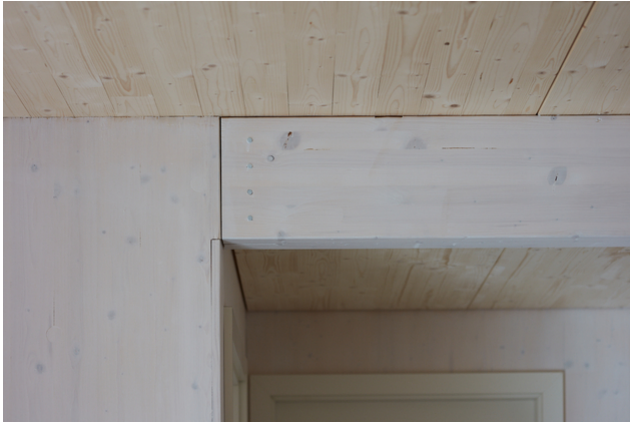
Downstand beam with milled steel plate