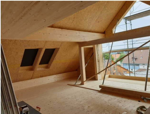
Construction phase attic