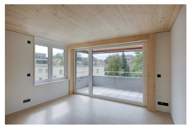
Passage to the balcony