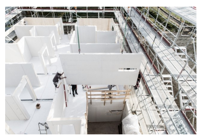
Assembly of the interior walls forming the fire compartment