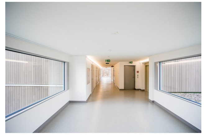
Hospital corridor with the rooms arranged on both sides