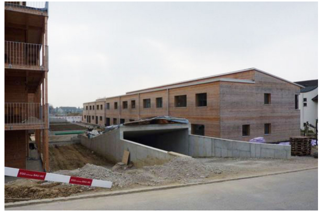
Entrance to the underground car park