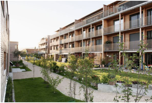
Residential complex with courtyard