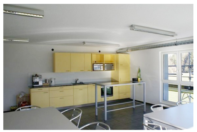
Catering room with kitchen