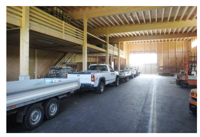
Adjustment room with gallery