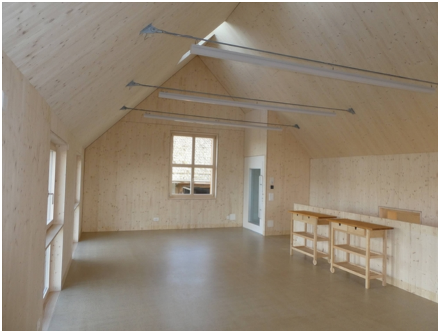
Tie rod for absorbing the static forces