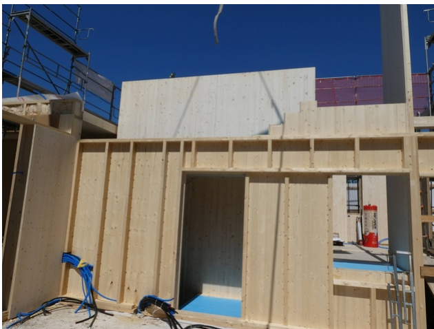
Assembly of wooden construction elements