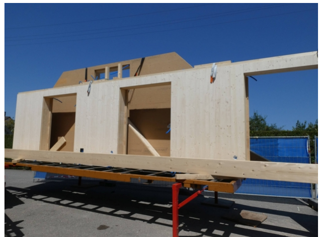
Delivery of the wooden construction elements