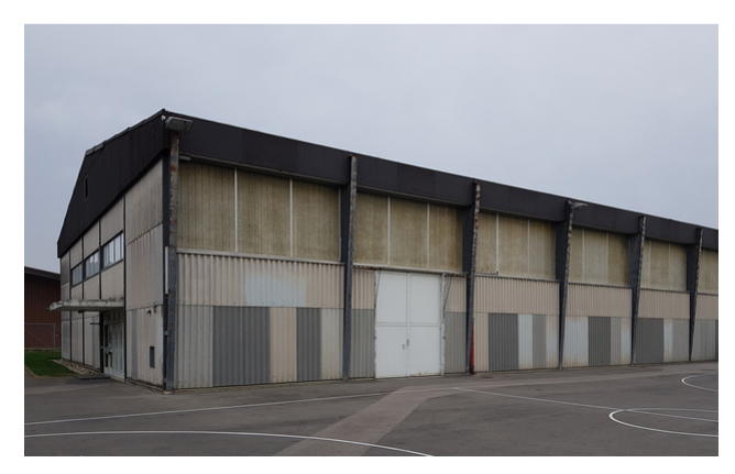
Gymnasium before renovation