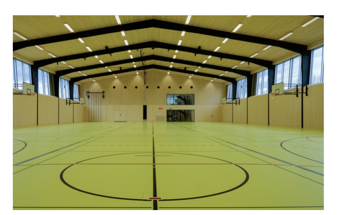
Interior view after renovation