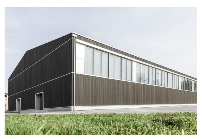
Gymnasium after renovation